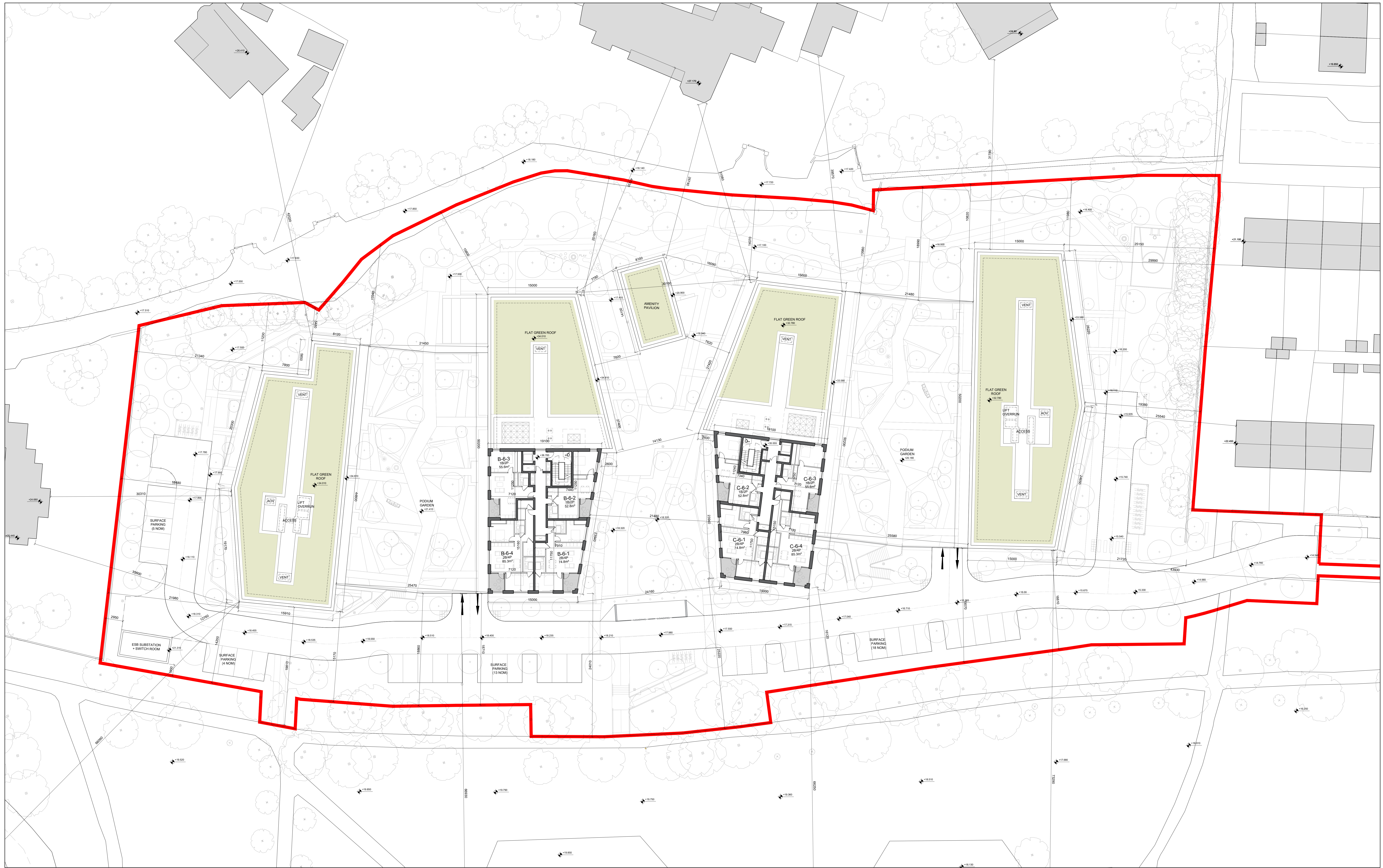
1 PROPOSED SIXTH FLOOR PLAN 200 1:200 @A0