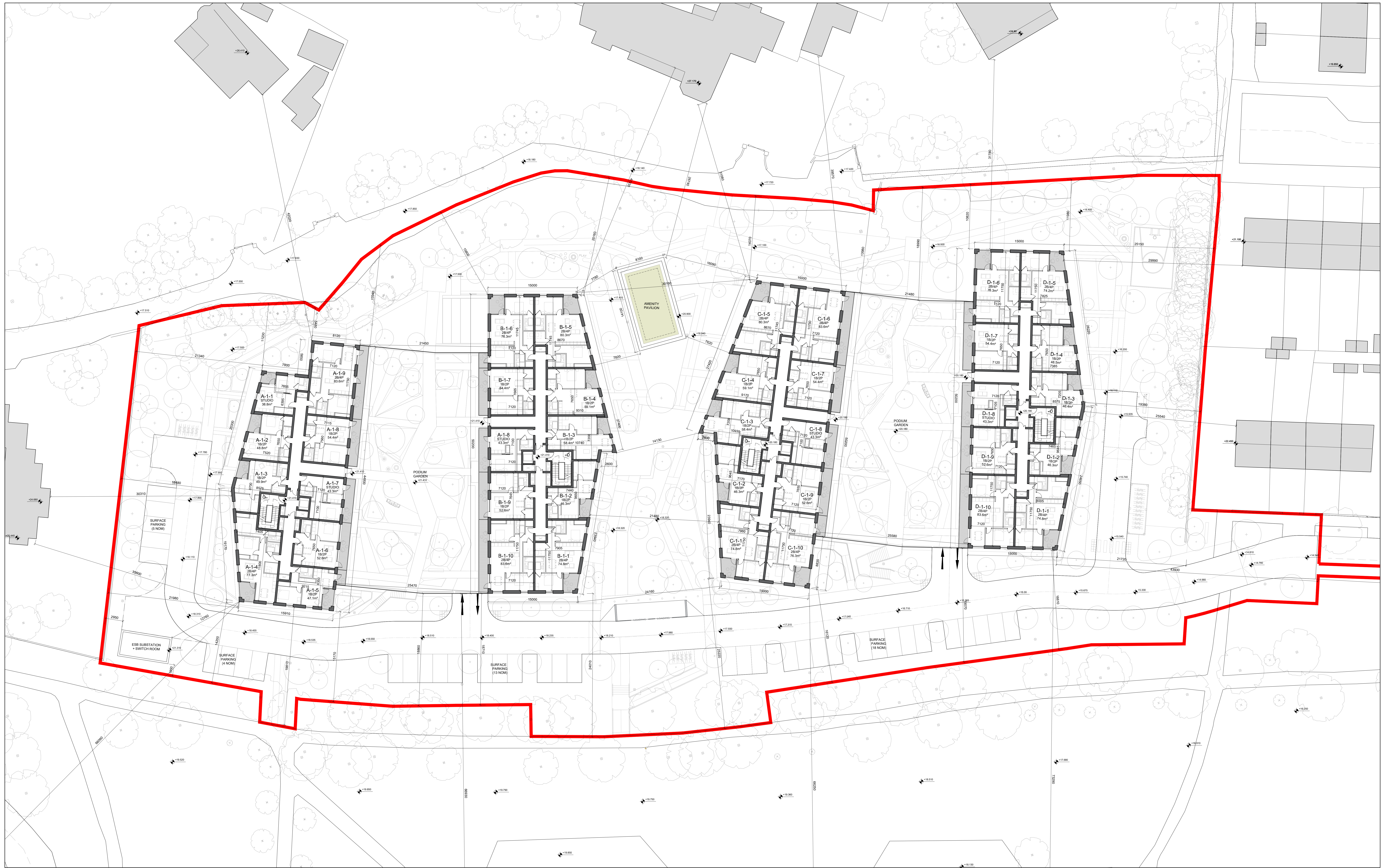
1 PROPOSED FIRST FLOOR PLAN 201 1:200 @A0