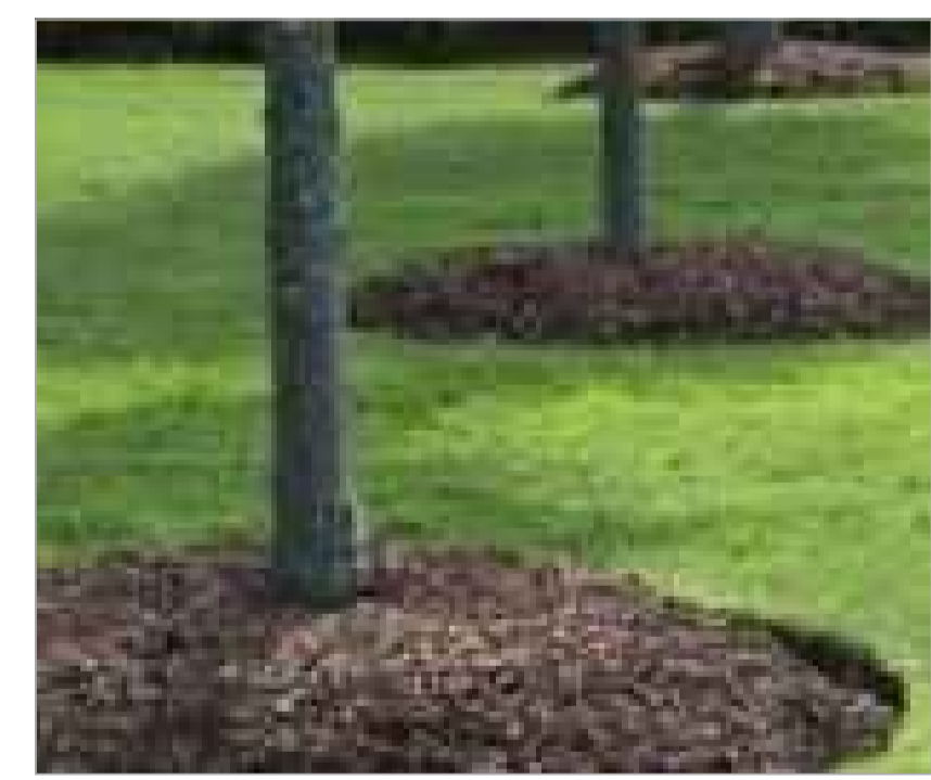
04 LAWN TREE PIT AND MULCH DETAIL

REFERENCE: THIS DRAWING IS NOT FOR CONSTRUCTION