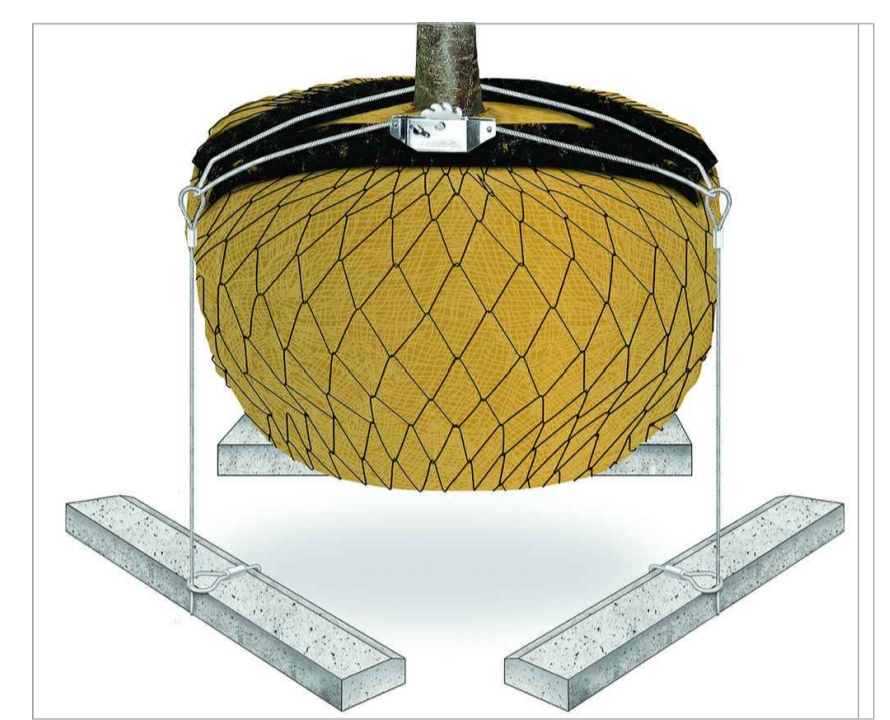
02 TREE ANCHOR SYSTEM